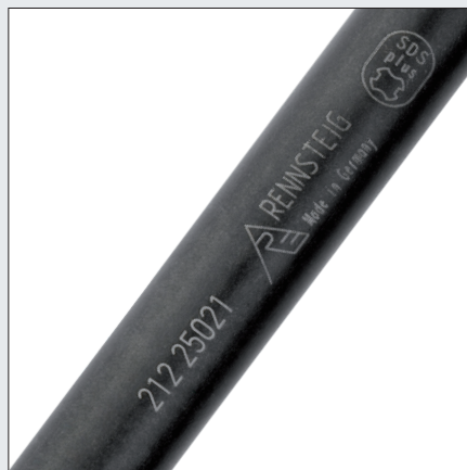
Komplett vergütet, Laserkennzeichnung