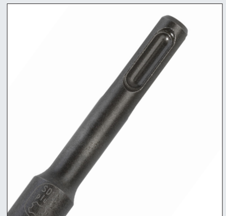
SDS plus Aufnahme